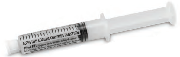
10 mL Pre-filled I.V. Flush Syringe