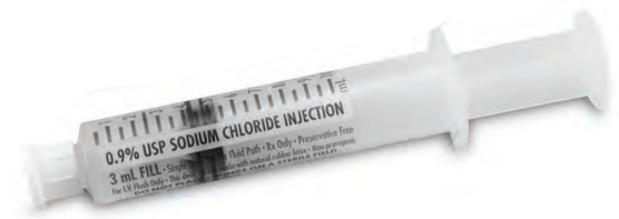
3 mL Pre-filled I.V. Flush Syringe