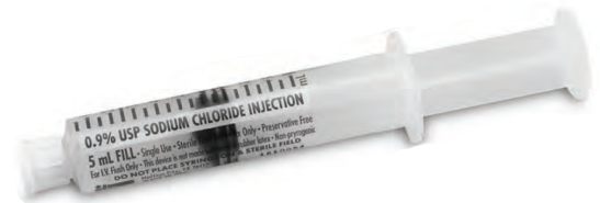
5 mL Pre-filled I.V. Flush Syringe