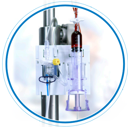
Safeset™ Blood Sampling System

With its integrated design and clear fluid pathway, Transpac™ IT can help you enhance patient safety with increased visibility and fewer opportunities for disconnections. Available in multiple configurations, the Transpac IT is a convenient tool to help you manage your critical patients.