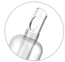
Large Murphy Eye