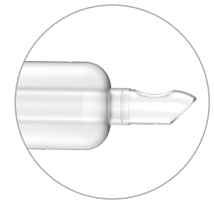
Soft Rounded Distal Tip