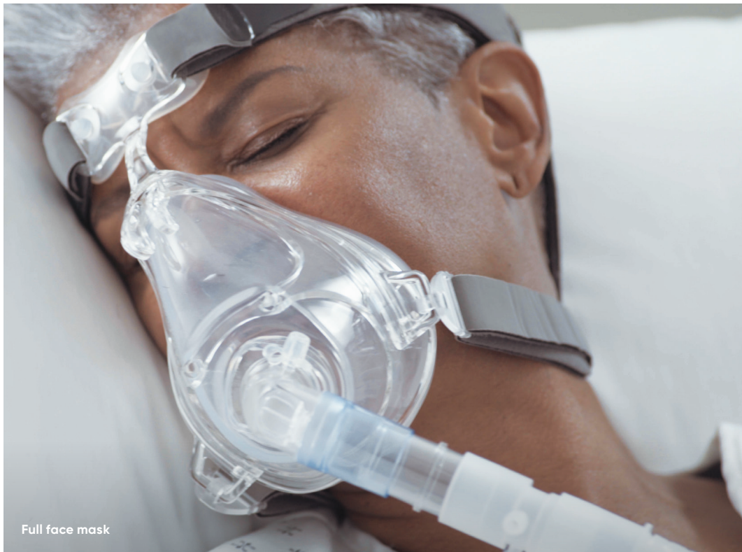
Full face mask