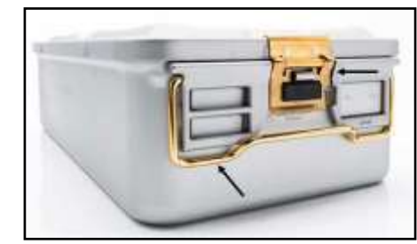
JS Perforated Bottom Identified by the Gold Handle & Latch

The SterilContainer<sup>™</sup> System full, three-quarter and half size JK Series and JN Series have three lid options.