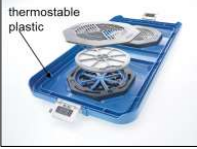
JPO Series PrimeLine

Aesculap® has performed the required validation tests, including accepted aerosol testing methodology for medical devices, and received FDA clearance for its sterile container products when used in the following sterilizations modalities. The modalities for each container series vary. Please refer to Sections 7.0 (Steam and EtO), 8.0 (STERRAD®) and 9.0 (STERIS®) Cycle Parameters to determine appropriate container bottom, lid, filter, lock and indicator card for sterilization cycle being used.