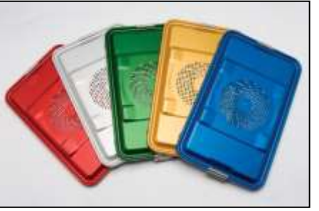
JK Series Aluminum Lids with Metal Retention Plate

The SterilContainer<sup>™</sup> System full, three-quarter and half size JK Series and JN Series have three lid options.