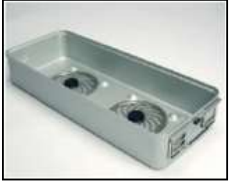
JN Perforated Bottom