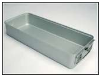
JK Solid Bottom

Throughout this IFU document, references to the SterilContainer<sup>™</sup> System include the SterilContainer<sup>™</sup>, SterilContainer<sup>™</sup> S and the SterilContainer™ S2 product families. References to the SterilContainer™ only include the JK / JN Series of products, references to SterilContainer<sup>™</sup> S only include JM Series of products, and references to SterilContainer<sup>™</sup> S2 only include JS Series of products.