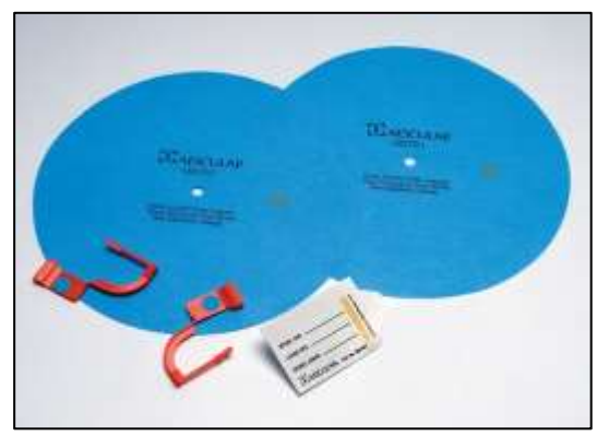
Image 1: Single Use Processing Supplies, Filters, Tamper Evident Locks, Indicator Cards

All Aesculap<sup>®</sup> filters, locks and indicator cards have been designed and validated specifically for the SterilContainer <sup>™</sup> System. They should not be used with other brand container systems. Aesculap<sup>®</sup> does not recommend using non-Aesculap<sup>®</sup> brand filters, locks and indicator cards, and cannot guarantee proper performance with these products. All processing supplies are shipped non-sterile.