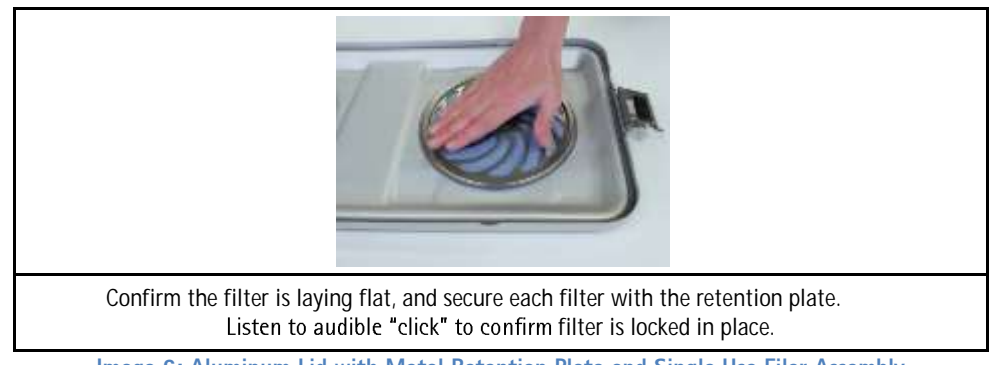
Image 6: Aluminum Lid with Metal Retention Plate and Single Use Filer Assembly

c. Confirm the filter lays flat, and secure each filter with the retention plate. Listen to audible "click" to confirm filter is locked in place.