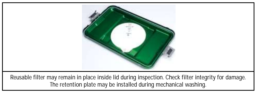
Image 5: Aluminum Lid with Metal Retention Plate and Reusable Filter

c. Confirm the filter lays flat, and secure each filter with the retention plate. Listen to audible "click" to confirm filter is locked in place.